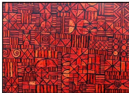
Ashanti Saga 84 x 60 inches