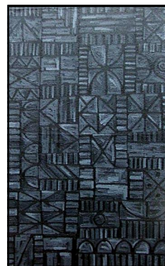
Sunsum 38 x 61