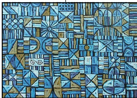
Liberation 54 1/4 x 75 inches

Afro-metaphysical Abstractions, or, call them whatever: afford me the opportunity to explore color performance: issues of flatness, textured surfaces, optical mysteries, transparencies, ambiguity, luminosity and dynamic forces: tensions between form and color, structure and imagery, subtle spatial and perspectival activity and implied movement. The primary role of color in my work is to suffuse the room where the paint-